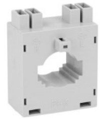
Current transformers DM2T0150